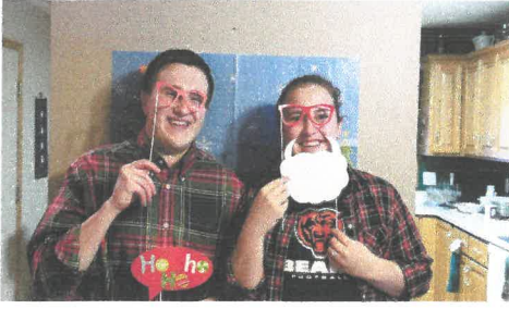
Having a little fun at Grandma's! December 30 th – New Richmond, WI

works through visitation and equipping the saints to rebuild a congregation that was on the verge of closing 23 years ago. The class has been a powerful experience so far, and God is definitely working on my heart for the mission of His church!